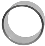
SL R sleeve

For detailed information, please visit roxtec.com .